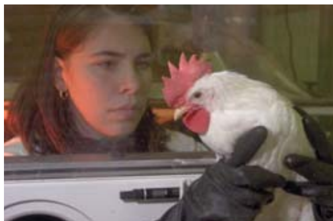
European researchers study the avian influenza viruses in order to develop new vaccines — Istituto Zooprofilattico Sperimentale delle Venezie, Italy

Even in the 21st century, new pathogens, such as SARS and avian influenza, are emerging. Outbreak-prone diseases such