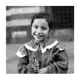
Kurdish girl in Diyarbakır, Turkey.