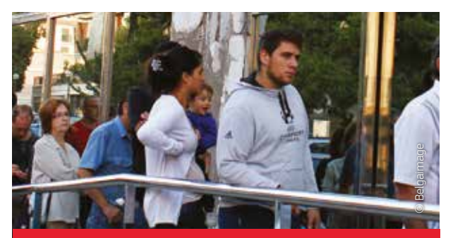
Generation Y: it must not be the first generation in 70 years to be poorer than their parents.

Previous special feature on this issue: Social Agenda n°36 on youth employment