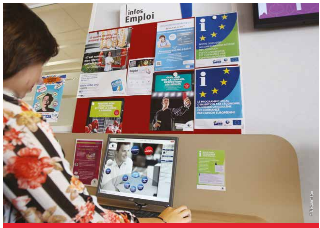
A driver for reform: the Youth Guarantee is helping public employment services consider youth as a specific group, in a customised pathway approach.

continued political commitment to the YG as a long-term, structural reform is required in order to effectively reap the benefits of the work carried out so far.