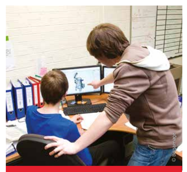
Promising start: 14 million young people have entered EU Youth Guarantee schemes since January 2014 and around 9 million took up an offer.

As far as apprenticeship systems are concerned, reflection is on-going on the creation of a Quality Framework for Apprenticeships. A European Alliance for Apprenticeships was launched in July 2013, bringing together governments with business, social partners, chambers, vocational education and training providers, regions, youth representatives and think tanks. It has mobilised so far 250 000 training and job opportunities.