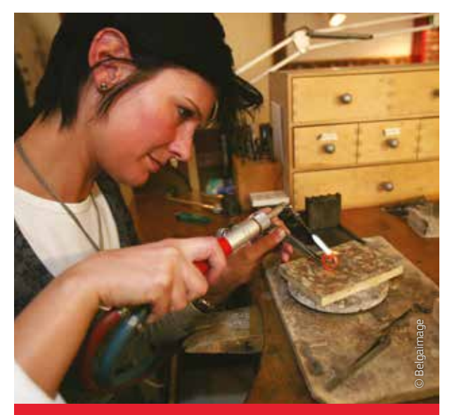
Goldsmith craft: the Youth Guarantee can lead to a traineeship with a goldsmith.

"I believe it has played a significant role in my rehabilitation. The fact that I've been forced to get out of the house several days a week to meet people, and practise my social skills, has been a vital part of the process."