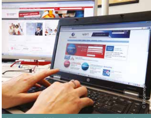
CV success: Since 2005, more than 60 million Europass CVs have been created.

The Commission adopted a proposal to revise the Europass Decision. Europass is a suite of tools and services which support the transparency of skills and qualifications across the European Union. With this revision, the Commission aims to simplify and modernise these tools for the digital age and to add a new feature using big data to map and anticipate labour market trends and skills needs. Europass is one of Europe's most used and well-known skills resources. Since it was established in 2005, more than 60 million Europass CVs have been created and hundreds of thousands of learners across the EU receive Diploma and Certificate Supplements every year which help to make their qualifications more readable and easily comparable abroad; backed-up with advice and support services on the ground in Member States.