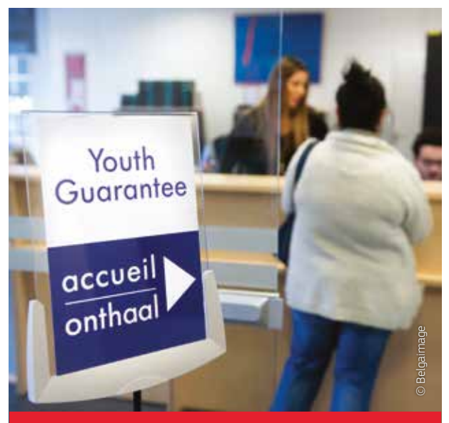
Activation: a push was given to traineeships proposed by public employment services, as part of active labour market policy measures.

Three major challenges are still facing EU countries, two years after the adoption of the QFT. Regulating open market traineeships is one of them. Filling the remaining gaps in traineeship regulation is another, especially as far as the lack of transparency, the duration and the recognition of traineeships are concerned – as well as learning content, in the case of open market traineeships. And a third challenge is to improve cooperation with social partners.