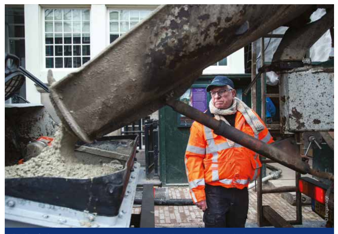
Who will pay for the pensions? The EU's demographic ageing is one of the four challenges identified by the outline of the future European Social Pillar.

Certainly, compared to the times when people did 40-hour weeks with the same employer for most of their working life. Where will you get your security from, today? Who will pay for your pension? One cannot go against the digital economy, which introduces more flexibility, but you have to accompany it with new security arrangements. The existing EU principles and rights are the starting