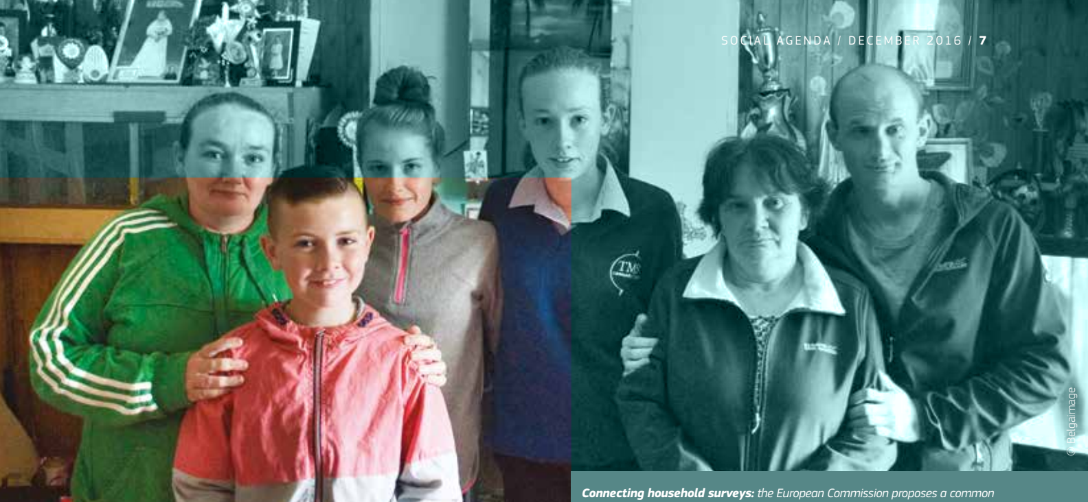
Connecting household surveys: the European Commission proposes a common framework for statistics bringing together seven household surveys.

that you get different perspectives about things you would normally take for granted".