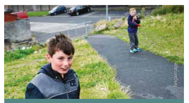
Deprived: FEAD delegates discussed innovative ways of delivering social inclusion measures.

The first two Fund for European Aid to the Most deprived (FEAD) Network meetings were held in Brussels on 26 September and 18 October 2016. The events allowed delegates to hear from projects and managing authorities in different countries and to discuss innovative ways of delivering accompanying and social inclusion measures. The first meeting focused on accompanying measures, the second one on the delivery of social inclusion measures (see p.24).