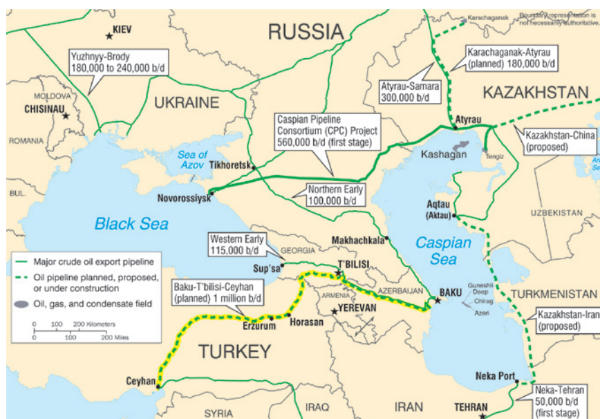
Figure 1. Black and Caspian Sea Oil Pipelines