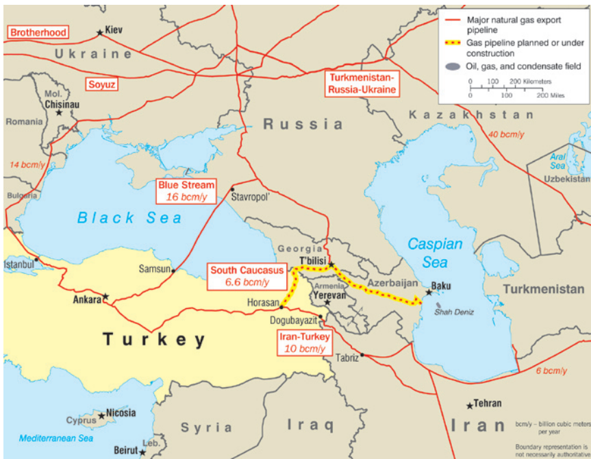
Figure 2. Black and Caspian Sea Gas Pipelines