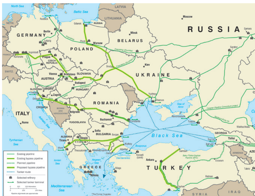
Figure 3. Proposed Black Sea Bypass Routes