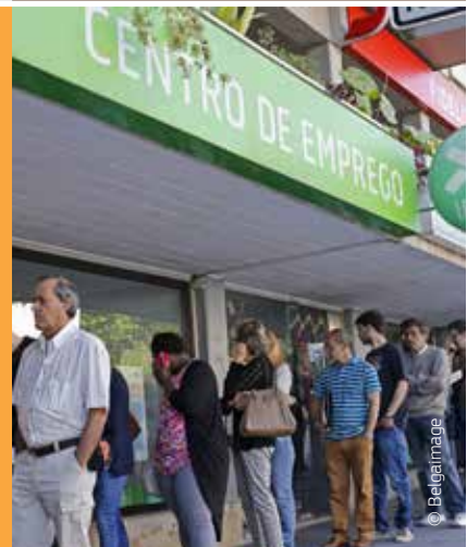
Globalisation adjustment: EGF co-funding has supported 138 888 redundant workers and 2 944 people not in employment, education or training since 2007.

Ten years ago, the European Globalisation Adjustment Fund (EGF) began its operations. "The fund is a practical demonstration of European solidarity because it gives financial support to Member States to help workers and companies adjust in response to changing patterns of trade. During the last ten years we were able to support more than 140 000 people", European Commissioner Marianne Thyssen stated. "It has a clear added-value because it tops up national support mechanisms for workers involved in mass lay-offs, and funds measures that are tailored to workers' specific needs in order to help them move on." Since its establishment in 2007, the Commission has received 148 applications from 21 Member States, totalling almost €600 million of EGF co-funding in support of 138 888 redundant workers and 2 944 persons not in employment, education or training (see page 6).