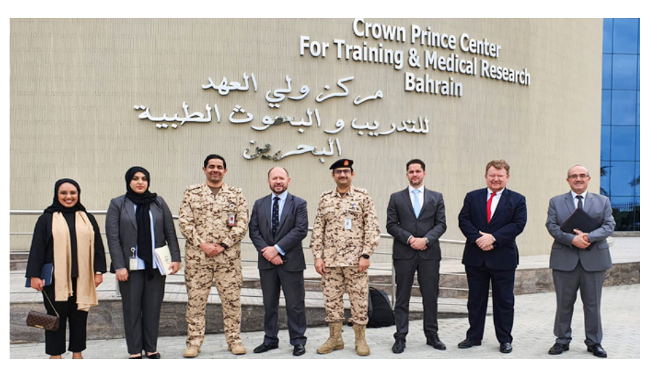
Project 82, Bahrain field visit - January 2020.