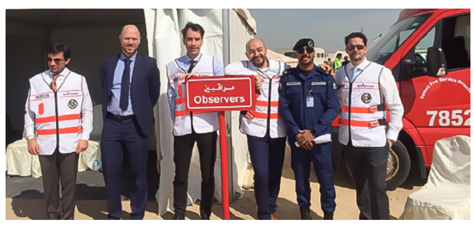
Above: Field Exercise Shamil 5 (the CoE Team of observers), March 2019, Kuwait. Below(various): Shamil 4 & 5 – joint exercise with multiple scenarios from 2018 and 2019 respectively.