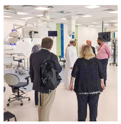
CoE Project 82, field visit in Qatar, November 2019.

During the first wave of the pandemic, the Regional Secretariat was tasked with developing guidance documents and standard operating procedures for NCEMA (National Crisis & Emergency Management Authority, United Arab Emirates) covering areas such as resilience strategies, in the field management and organization, testing protocols, contact tracing and escalation strategies. Throughout the CoE international network, new data, guidelines and information relevant to the medical management of COVID-19 patients and general emergency response have been shared and the CoE Secretariat has also supported the EU Delegation in Abu Dhabi and member state embassies on COVID-19 management and developments.