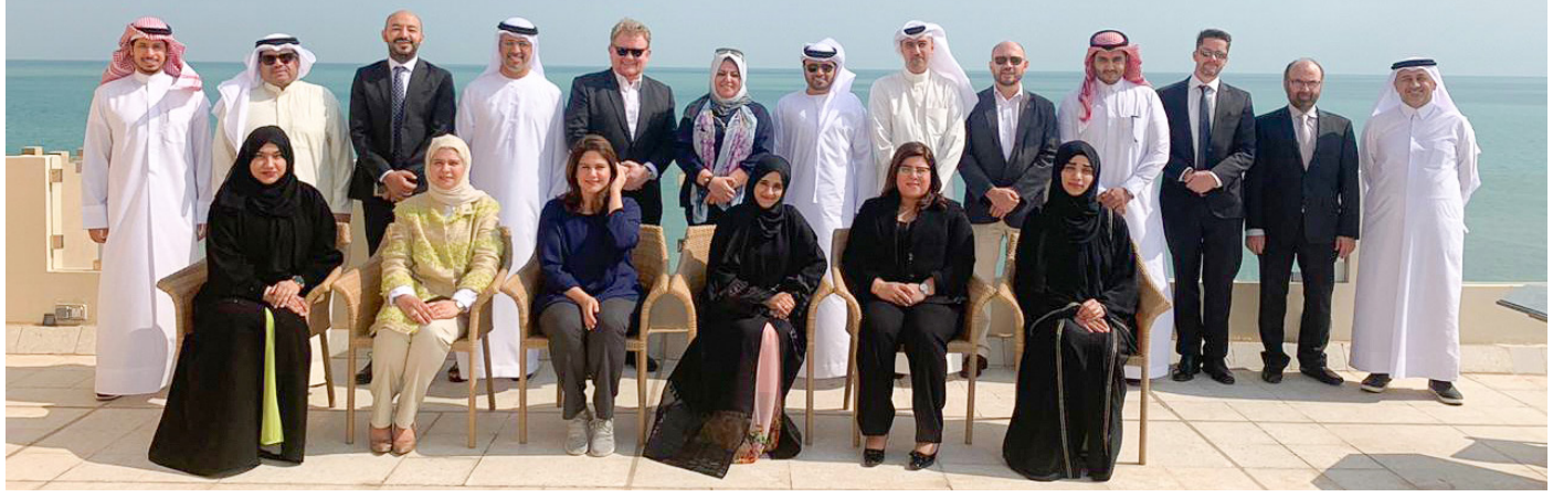
CoE Project 82, First coordination meeting, November 2019, Kuwait.