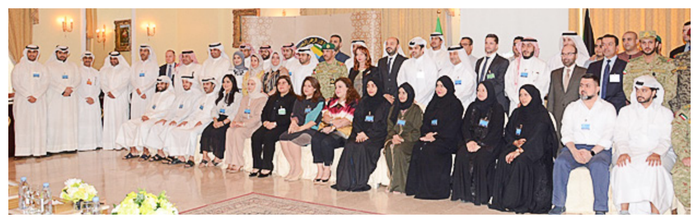
Project 82 - First regional training in Kuwait.

Considering the current COVID-19 crisis and the role of the medical services in responding to it, we can easily assess that Partner Countries were on the right path. The GCC region took advantage of the experience made through Project 54 (P54) entitled "Capacity building for medical preparedness and response to CBRN incidents" previously implemented in the Middle East region (2016-2019).