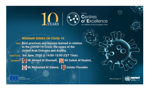
Example of a backdrop used for Webinars

in areas such as incident management, physiological impacts and education.