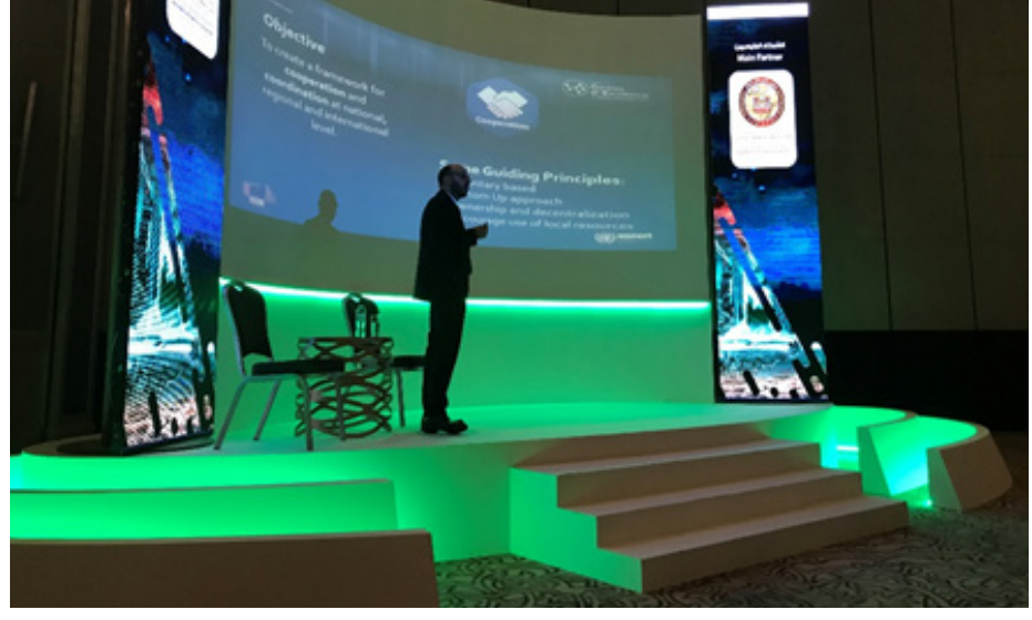
Crisis & Emergency Managements Conference(CEMC), March 2019, Abu Dhabi - UAE.