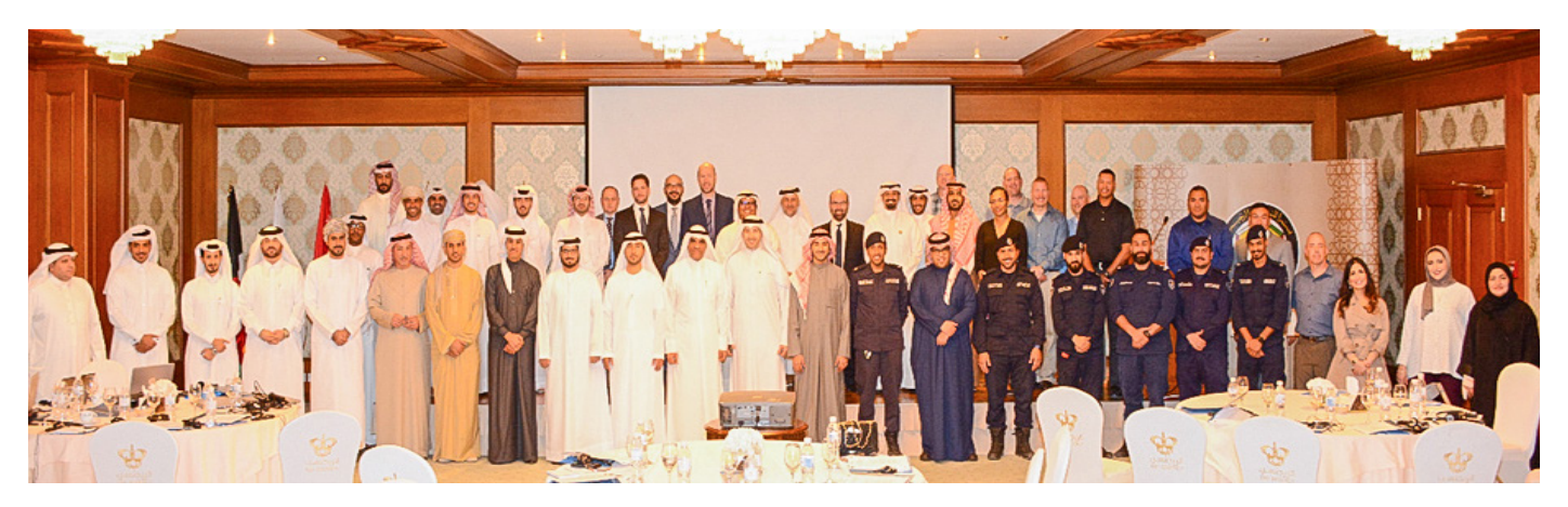
CoE-GCC EMC Chemical and Biological Threats Workshop, December 2018, Kuwait.