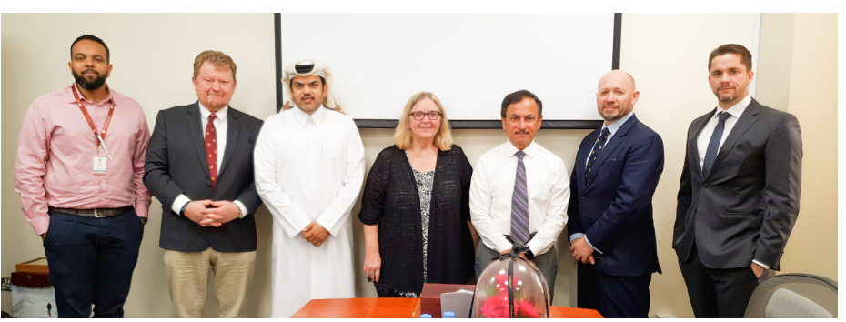
Project 82, field visit in Qatar - November 2019.